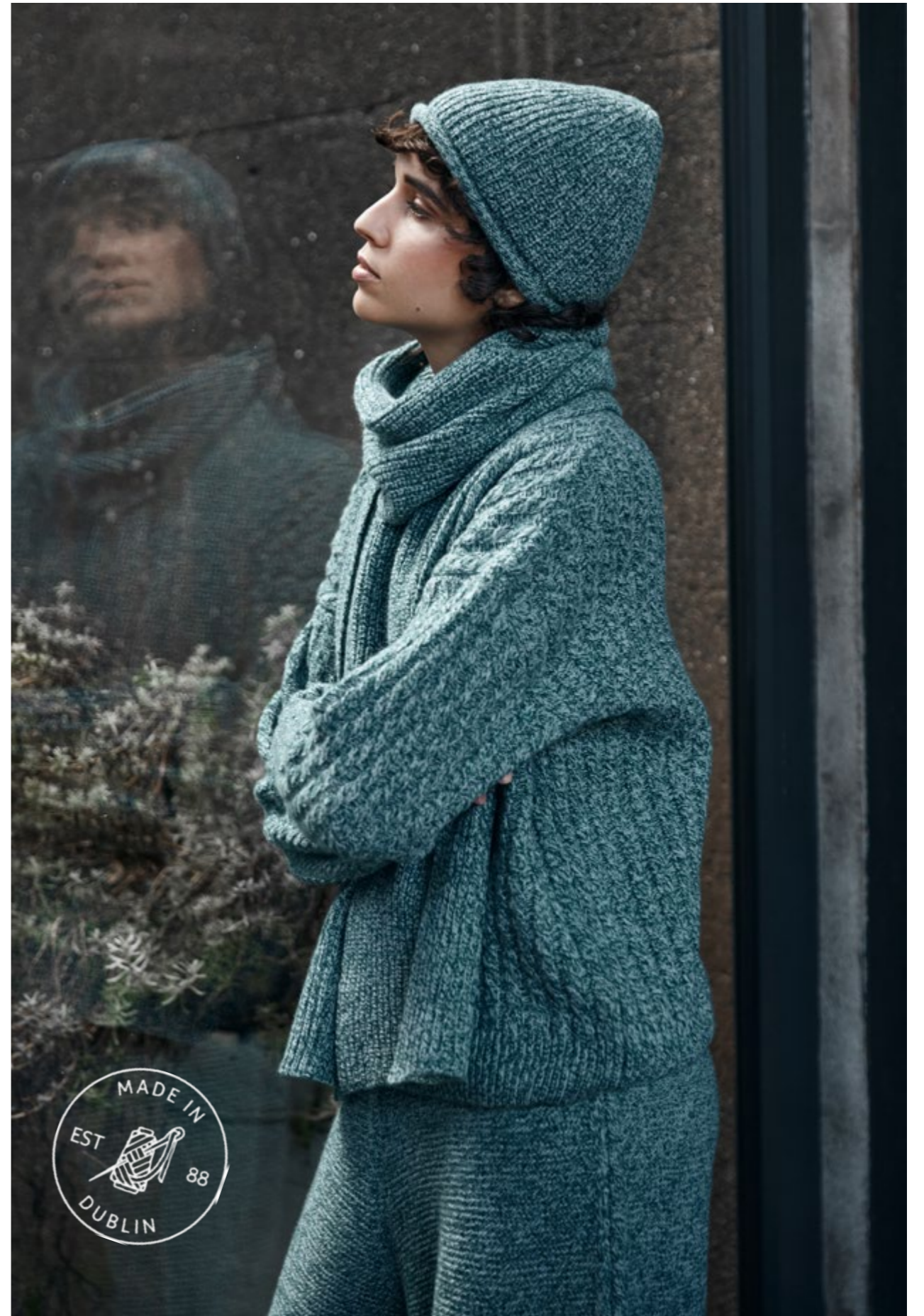
'Corbin' Cable Crew Neck C241 + 'Kestrel' Cropped Trousers C243 + 'Sparrow' Scarf C244 + 'Mistle' hat C246 all in Larimar