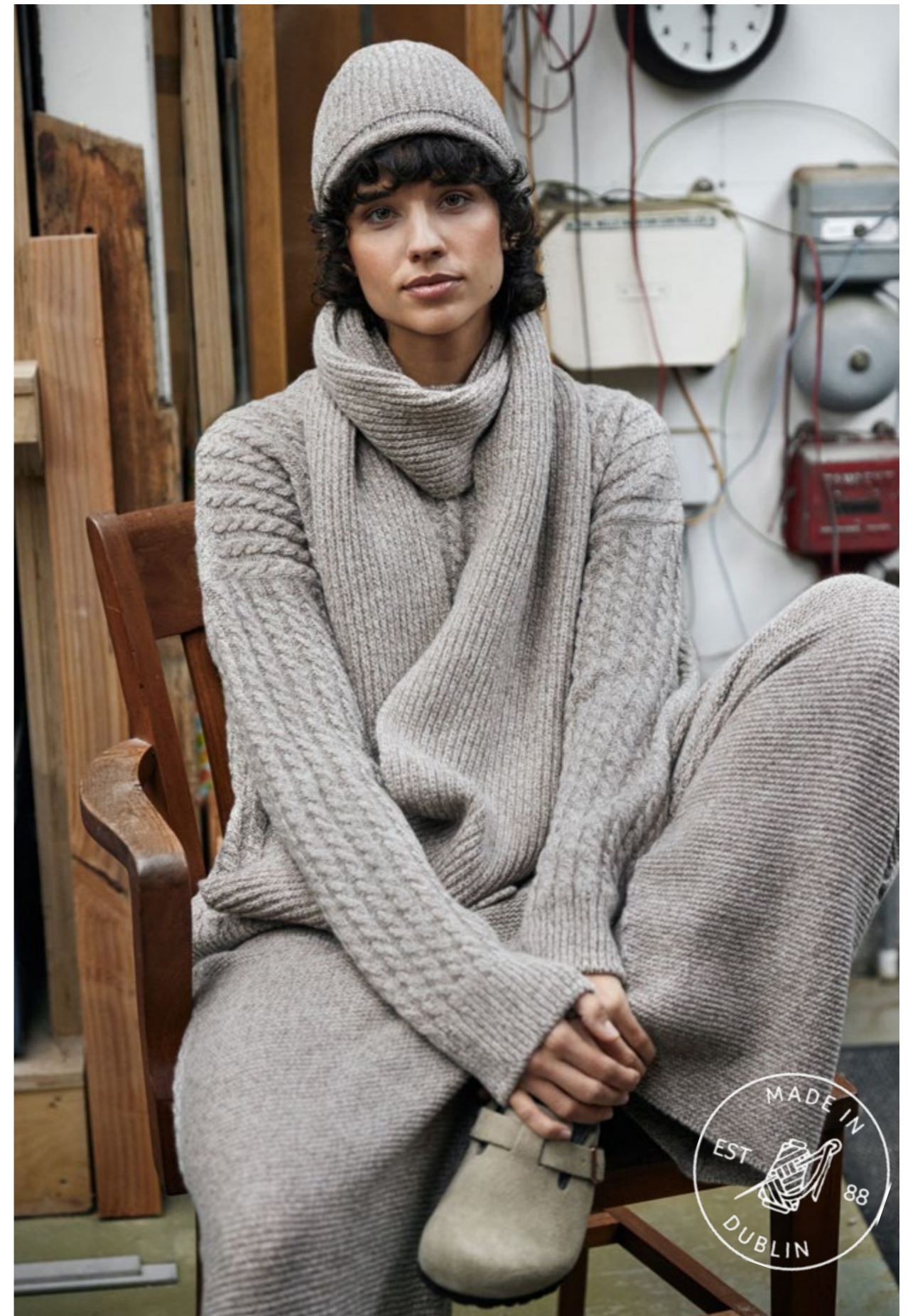
'Corbin' Cable Crew Neck C241 + 'Kestrel' Cropped Trousers C243 + 'Sparrow' Scarf C244 + 'Mistle' Hat C246 all in Eggshell