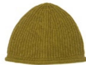
One Size 'Mistle' Hat C246