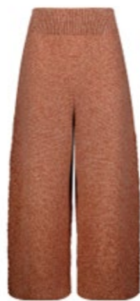
XS - XXL 'Kestrel' Cropped Trousers C243