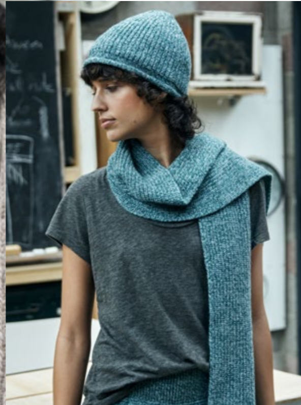
100% Extra Fine Virgin Wool