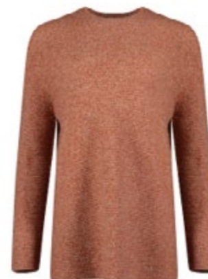
XS - XXL 'Osprey' Funnel Neck