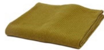
One Size 'Sparrow' Scarf C244