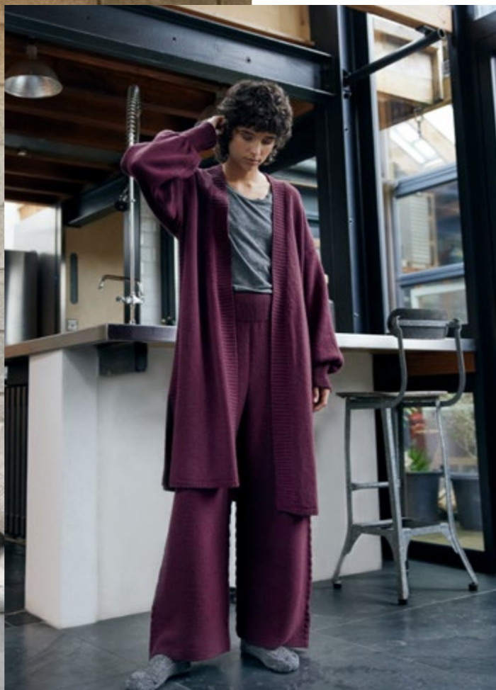
100% Extra Fine Virgin Wool