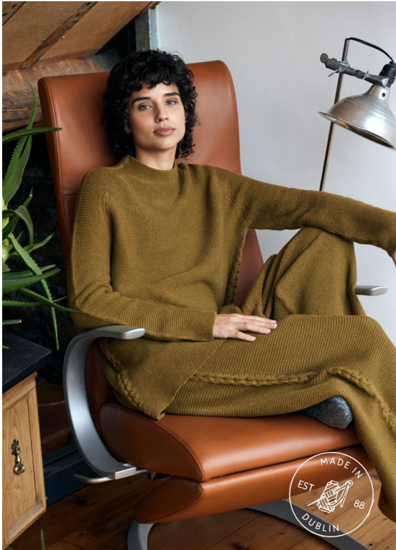
'Osprey' Funnel Neck in Khaki