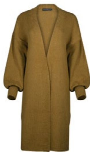
XS - XXL 'Raven' Jersey Cardigan C247