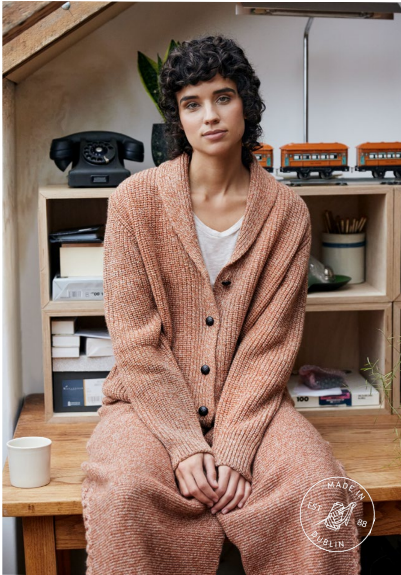
'Robin' Shawl Cardigan in Larimar