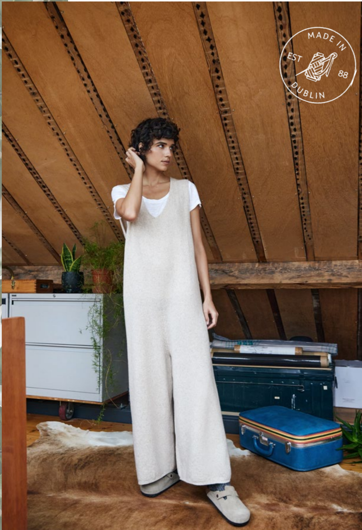
'Sanderling' Playsuit in Bone