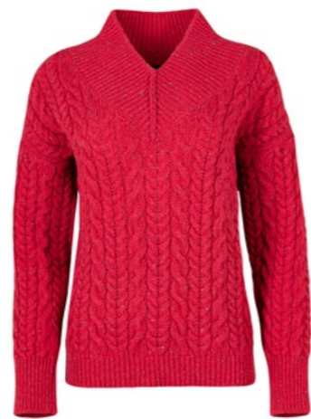
'Mill Lane' Cable V-neck