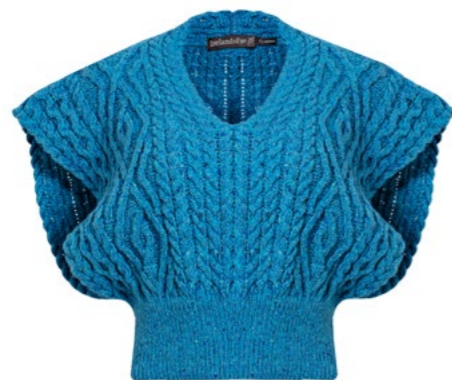
'Farmleigh' Diamond Vest