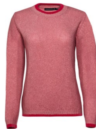
'Slaney' Crew Neck