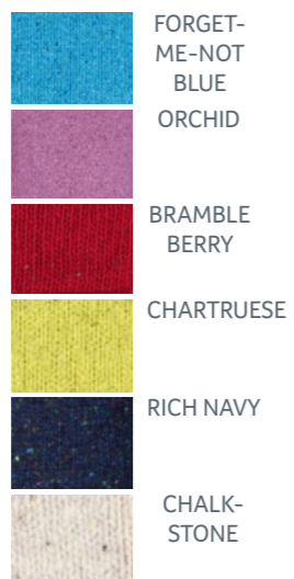
'Lombard' Diamond Scarf A993 One Size