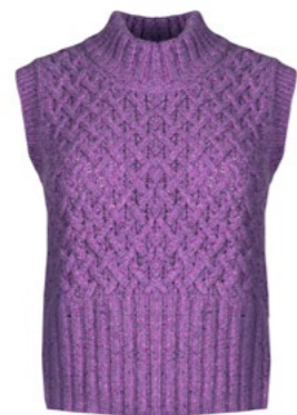
'Ballybricken' Trellis Cropped Vest