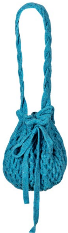
'Melinda' Bag C209