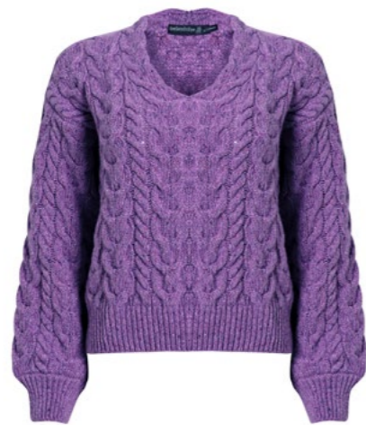
'Hapenny' Horseshoe Sweater