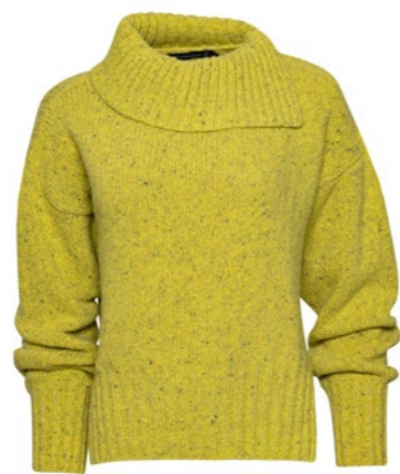
'Wilde' Slouchy Funnel Neck Sweater